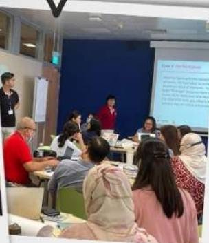
Understanding Union-Management Partnership in NYP