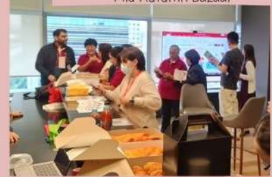
IMDA Kopi Session