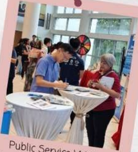
Public Service Week Learning Festival 2023

We have also been buzzing with enthusiasm as we shared the latest perks and benefits with our existing members and those considering to join the AUPE family.