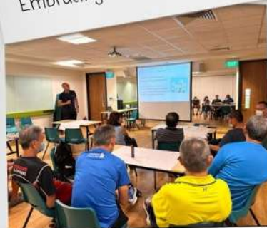
Re-imagining Retirement & Possibilities @ SportSG