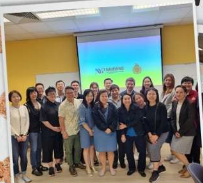
Understanding Union-Management Partnership in NYP

AUPE also actively engages supervisors and reporting officers to foster a deeper appreciation of union-management partnerships. These interactions serve as a platform to share with them about the vital role unions play and how our joint efforts and collaborations can elevate the workplace experience and career development journeys for all staff.