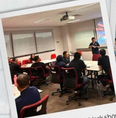
Embracing Growth Workshop