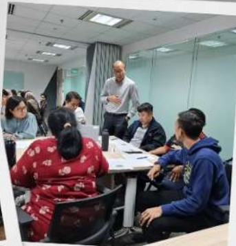
at Singapore Customs