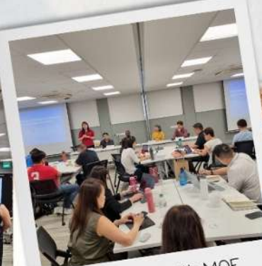
Dialogue with MOE School Leaders