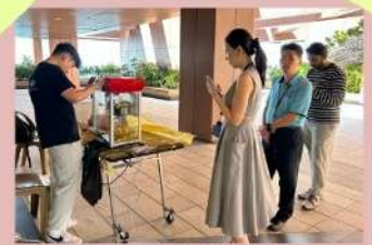
Popcorn Giveaway at MAS Mid-Autumn Bazaar