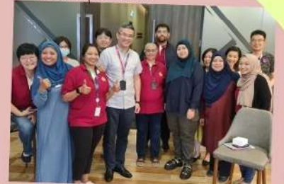
IMDA CE & DCE supporting the Kopi Session