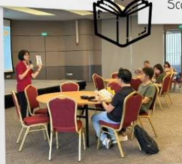
Managing Conflicts and Grievances Workshop @ NEA