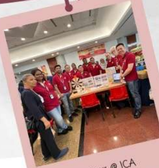
Bazaar @ ICA