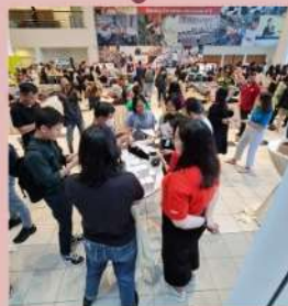
Public Service Week Learning Festival 2023