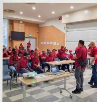
Financial Planning and Scam Awareness @ NEA