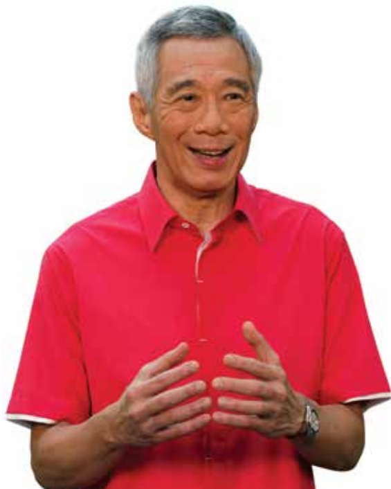
Mr Lee Hsien Loong Prime Minister

For the economy, we are making good progress transforming our industries. We are servicing advanced jet turbines, researching new cures for diseases, and pushing boundaries in FinTech services. Our seaport and airport are expanding to meet the growing demands of a dynamic Asia. The two integrated resorts, or IRs, are being enhanced to attract more tourists. Our tech and startup scenes are flourishing. Agencies like Enterprise Singapore are helping entrepreneurs and companies to strengthen, scale up and expand into the international market.