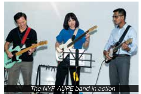
The NYP-AUPE band in action