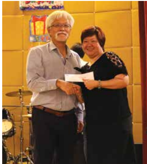
The celebrations ended with an exciting lucky draw and everyone left the hall with big smiles on their faces.