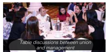
Table discussions between union and management

The table discussions between management and union leaders during the Gathering further encouraged both parties to highlight ways they could work with each other in this journey moving forward.