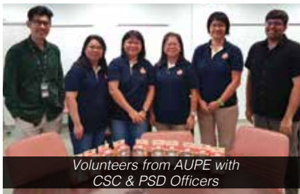
Volunteers from AUPE with CSC & PSD Officers

It was heartening to see the OSOs participating actively and excitedly asking questions on how to download apps, log into their SingPass accounts and even setting up PayLah to pay friends!